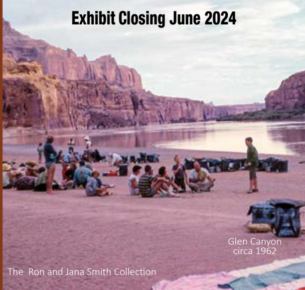
Glen Canyon circa 1962